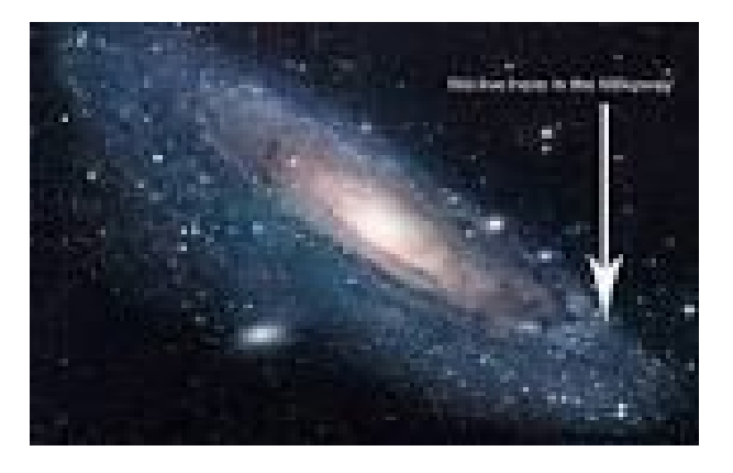
Our Milky Way Galaxy....400 billion stars!

I have asked numerous theologians, preachers for their idea of the future. Not necessarily about the Millennium or the rapture....but the very long term future! Where is earth in a million years time? Where is history and mankind heading? Is there still an earth. Are there a moon and stars? Does life go on in this universe?